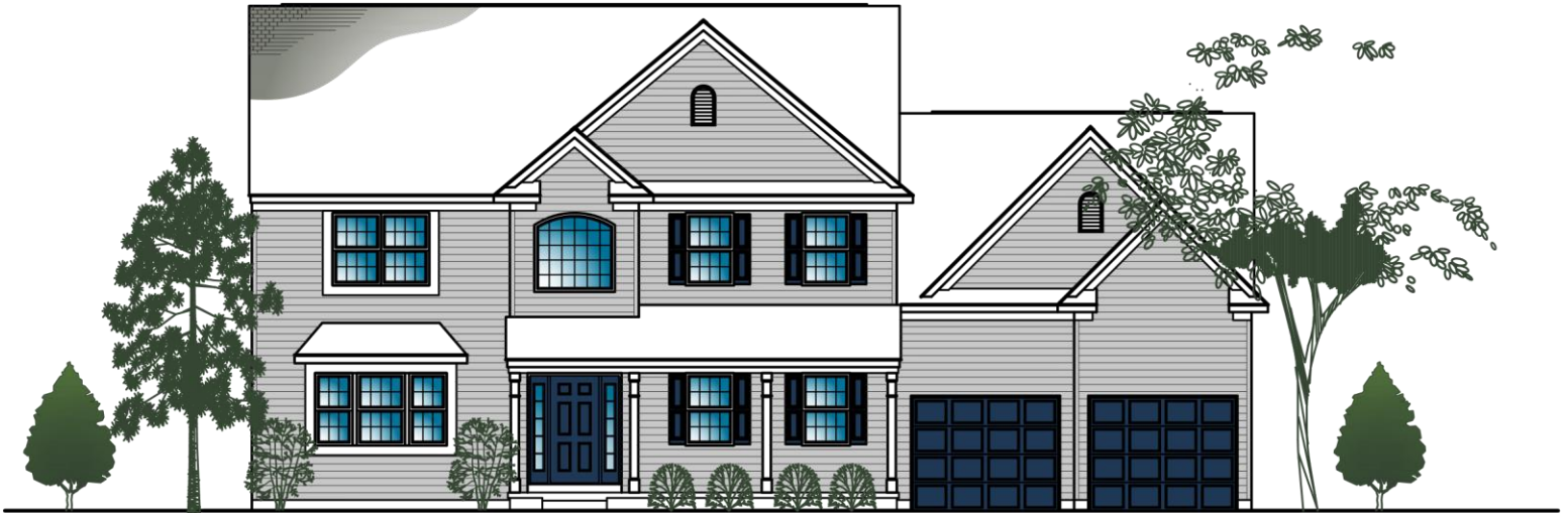
FRONT ELEVATION (ELEVATION C)

ARTIST RENDERING - SOME ITEMS MAY BE OPTIONAL