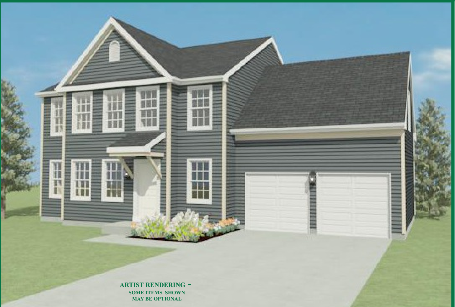
ARTIST RENDERING - SOME ITEMS SHOWN MAY BE OPTIONAL