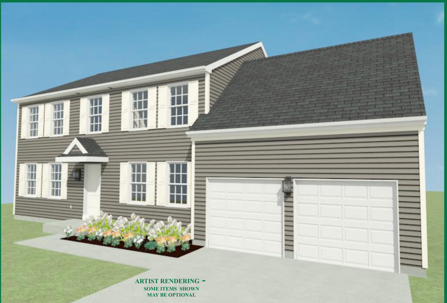
ARTIST RENDERING - SOME ITEMS SHOWN MAY BE OPTIONAL