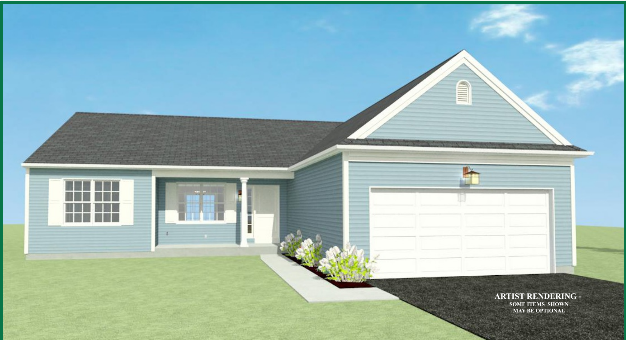
ARTIST RENDERING - SOME ITEMS SHOWN MAY BE OPTIONAL