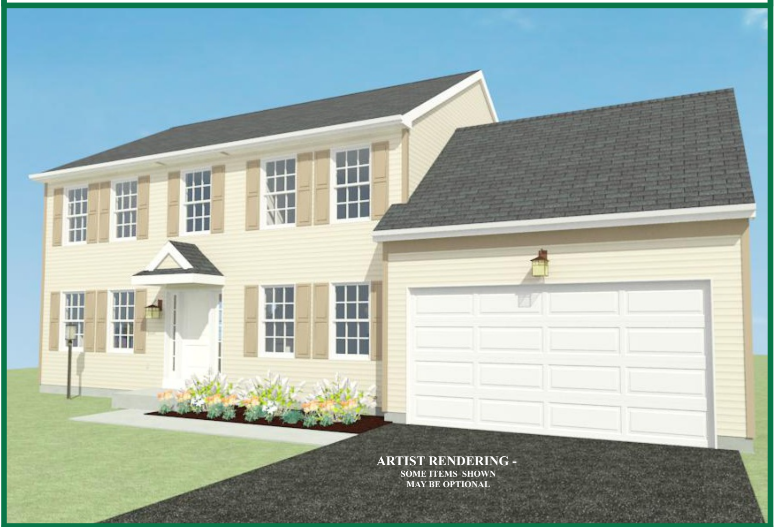
ARTIST RENDERING - SOME ITEMS SHOWN MAY BE OPTIONAL