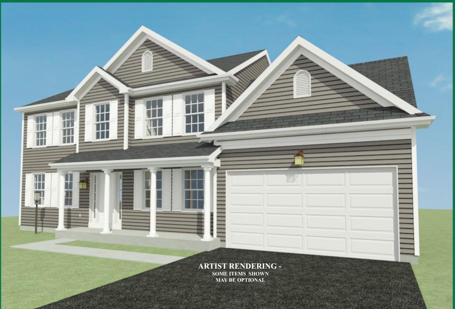
ARTIST RENDERING - SOME ITEMS SHOWN MAY BE OPTIONAL